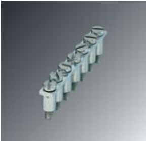
Fixed bridge, number of positions: 7, color: silver

Please be informed that the data shown in this PDF Document is generated from our Online Catalog. Please find the complete data in the user's documentation. Our General Terms of Use for Downloads are valid ( http://phoenixcontact.com/download )